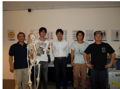
DMTR >Singapore, 26-30Nov12