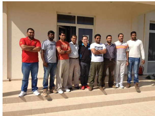
DMT > Jeddah, 6 - 15 Nov 2012

The next training has been scheduled in Singapore, 7 - 18 Jan, or 28 Jan - 8 Feb or Malaysia 12 - 21 Jan or New Delhi 11 - 21 Feb 2013. Click Here for the flyer or Contact us for more information.