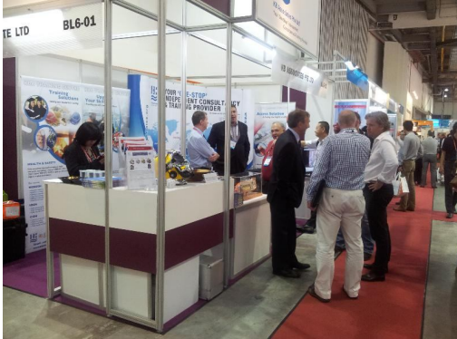
Busy at the booth