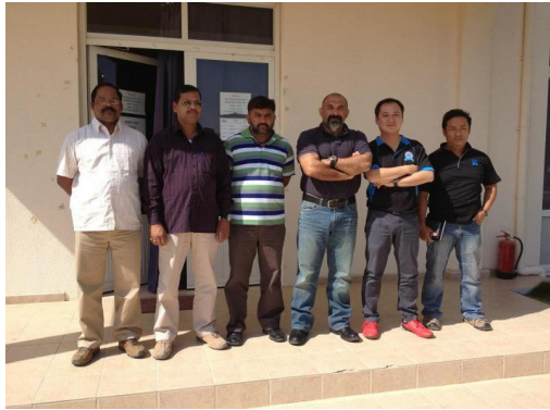
DMTR > Archirodon(Jeddah), 1 - 5 Nov