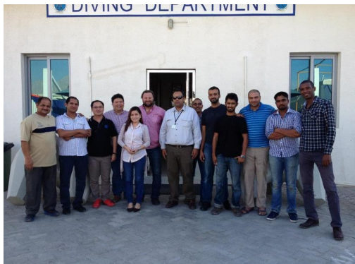
UAE > DMT (17-26Nov) & DMTR(27Nov-1Dec)