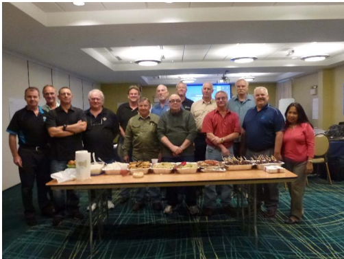
Lake Charles - USA, 15-19 Oct 2013