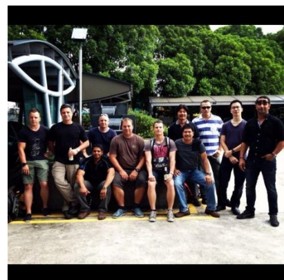
DMTR > Singapore, 29Oct-2Nov