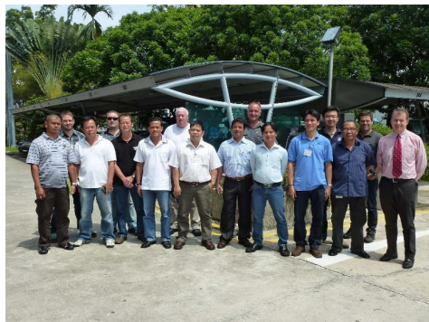
Singapore, 29Oct - 2Nov 2013